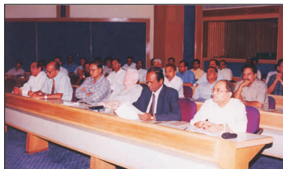
Official & Industrial Leaders