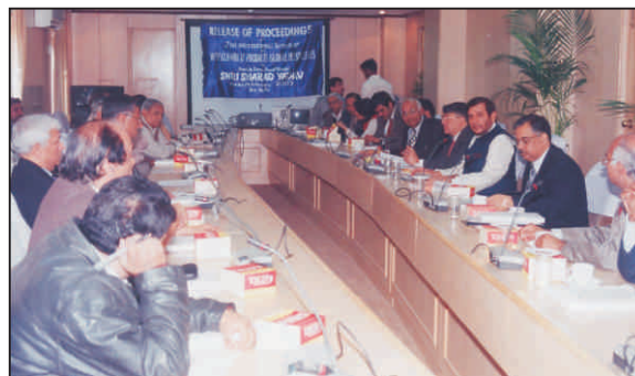
A View of Audience

National Seminar on “Potential of M.P. Wheats”: The Seminar was organized by Wheat Product Promotion Society (WPPS) in association with Federation of M.P.